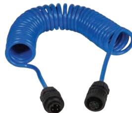
EZ spiral cable