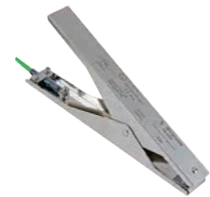
heavy duty clamp