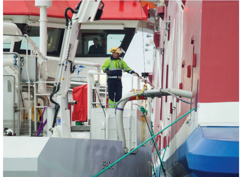
Viking Grace takes on LNG from Seagas, the world's first LNG bunker vessel.

The ASTM is no stranger to this sort of challenge. Indeed, over its more than 100 years of existence, it has successfully developed more than 12,000 globally used standards. In short, the ASTM is a logical choice to lead the creation of an operational safety standard. Plus, it has an established track record of developing highly regarded standards tied specifically to the oil and gas industry.