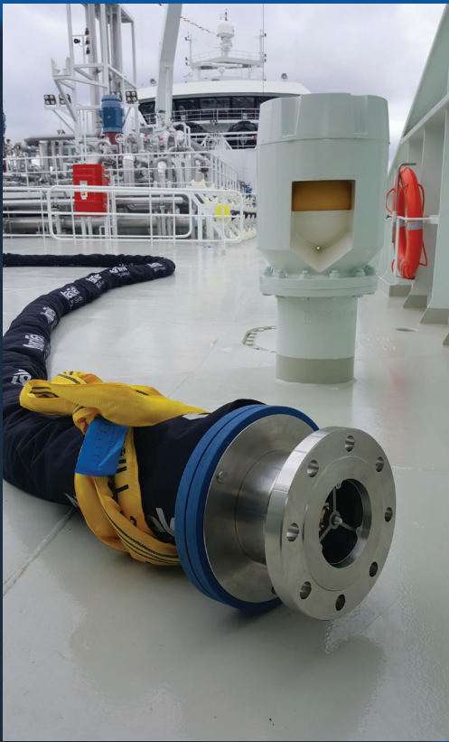
Coralius is fitted with Mann Tek 6-inch PERC and wire drift ESD system.

With a capacity of 5,800 cubic meters of LNG, the Coralius is highly suited as a small-scale carrier, featuring a ship design that includes a flat working deck specially engineered for side-by-side transfer of LNG.