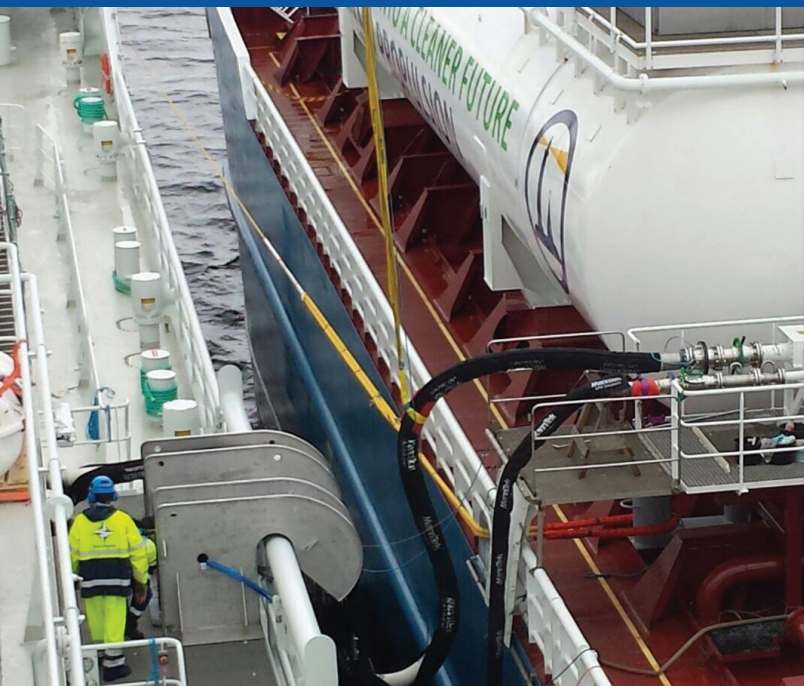
Coralius performs ship to ship LNG bunker operation.

The success of the Coralius continues the notable success of LNG bunkering activities for Sirius Shipping, with nearly 1,400 such operations carried out to date thanks to MannTek's innovative system engineering. Indeed, MannTek is the most important supplier of LNG transfer equipment to the major LNG fueling facilities throughout the world. In addition to the M/S Viking Grace (the world's largest passenger ferry), other notable MannTek LNG transfer system installations include Tote Maritime's M/S Isla Bella (the first LNG-powered container ship) and Harvey Energy (the first LNG-powered OSV in America). Dixon supplied the couplings for the Harvey Energy project.