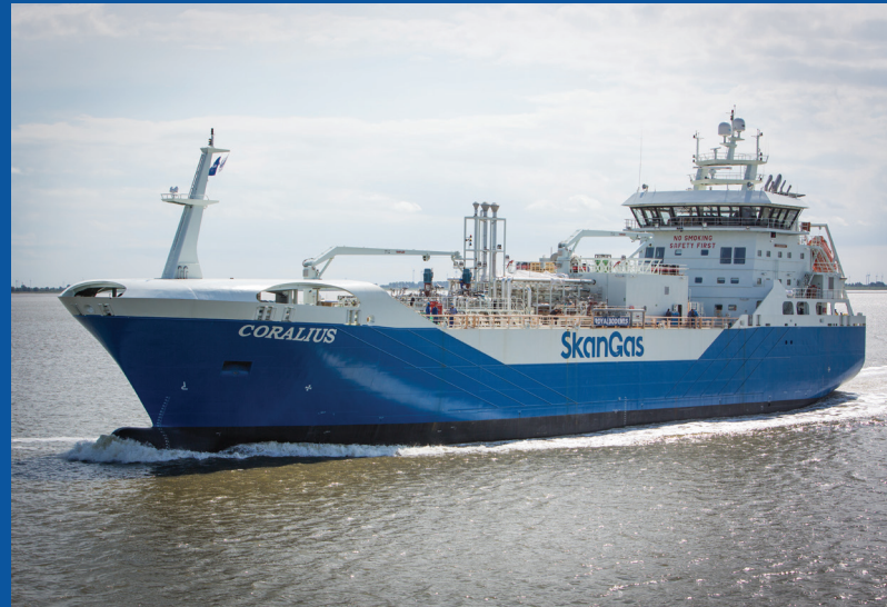
Coralius's size makes it well suited for small-scale carrier and bunkering duties.

The ship's bunker delivery system was engineered to meet the latest SGMF guidelines ensuring safe and responsible use of LNG as a commercial marine fuel. It also meets the requirements of numerous regulatory bodies – among them SIGTTO, ISO, EN, Class approval with DNV, and BV. The transfer system, supplied by MannTek, can also be provided with a SIL 2 classification.