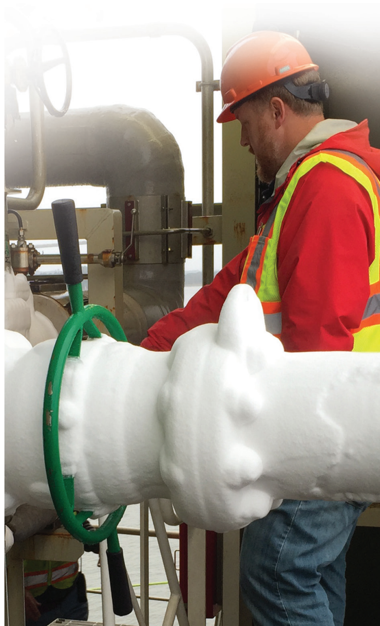
Ice builds up on the 6-inch LNG transfer lines during a ship bunker. The extreme temperature of LNG can cause damage to the ships structure if exposed to the LNG directly.