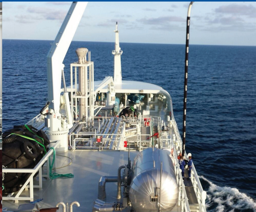
With over 1,400 bunkers performed, Coralius is a notable success.