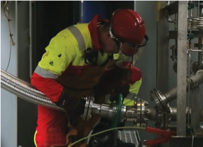
Ship's personnel make a connection of the bunker supply hose to the ship's bunker manifold.

Also important for any pressurized liquid system involving LNG is to ensure that the product is transferred without incurring damage to the piping and possible leakage. “Not only is LNG highly volatile and ignitable, the extreme cryogenic temperatures of LNG also require special materials for handling – such as in the case of ship hull steel which can become immediately brittle, crack and fail when exposed to LNG,” Gilman notes.